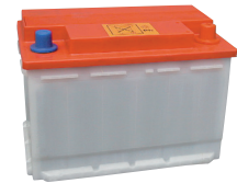
only for models code: 3.554.0053-3.554.0054