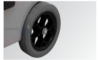
Rubber-coated castor wheels and large back wheels.