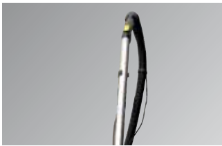
Long stainless steel vacuum tube for convenient, effortless work