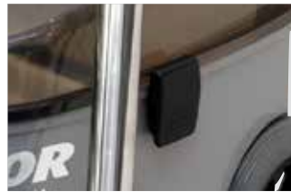
Professional plastic hooks