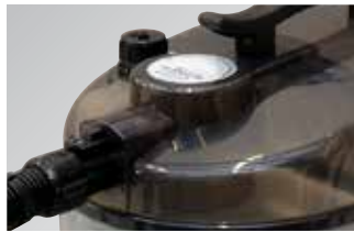
Thorough cleaning through the 4 bar spray pressure and 230 mbar suction power